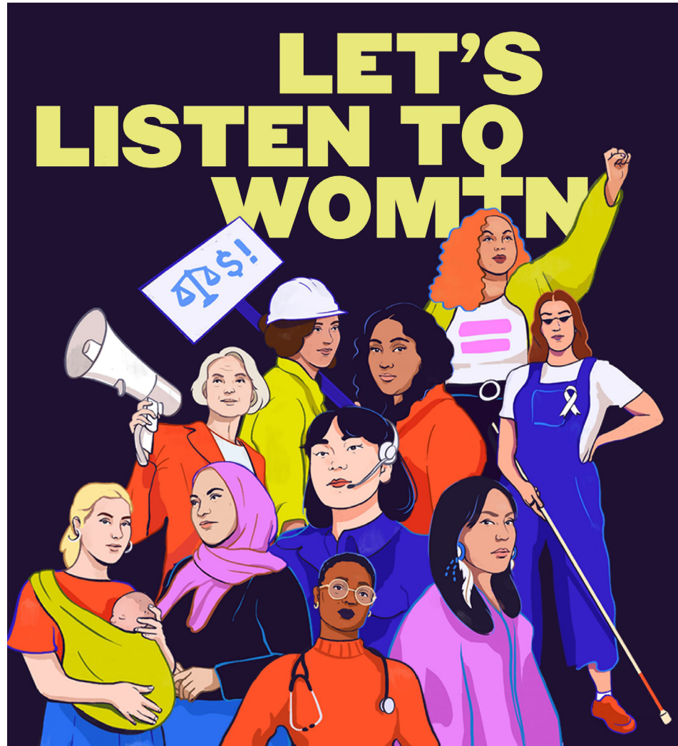
COLLECTIF 8 MARS | International Day of Women's Rights

With this slogan, we are committing to a simple yet transformative action. If we listened to women instead of ignoring them, devaluing their work, underpaying them and excluding them from decision-making positions, it would be a whole new world.